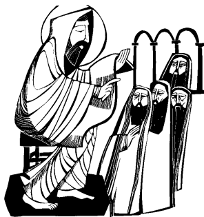
Luke 1.1-4; 4.14-21