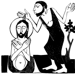
Baptism of the Lord