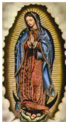
Our Lady of Guadalupe Mother of the Americas and Patroness of Human Life

Sign of Hope – Your donation to Catholic Social Services supports all its programs, but especially: individual and family counseling, SAFE HOUSE and SAFE PASSAGES for street kids, KAIROS House for persons having HIV/AIDS, FIRST STEPS for women and children affected by fetal alcohol spectrum disorder, our Elderly Adult Resource Service (EARS) for abused seniors, a Parent-Teen Mediation program, and GENESIS II – a program for youth and their families affected by drug addiction, and the Rotary Centre for New Canadians, serving immigrants and refugees. Please give generously.